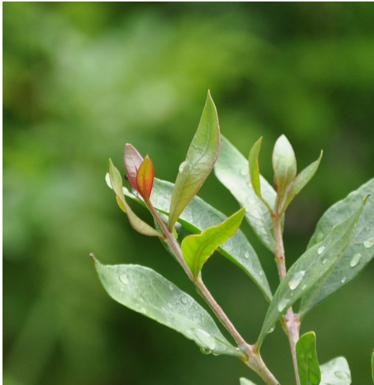
Henna: lawsonia inermis . New leaves grow after summer rain.

A friend asked me to decorate her skin with henna when I was teaching at Kent State University in 1992. It was part of her culture and she loved to have henna for celebrations. I had heard of henna but didn't know much about it, so I began researching. My curiosity quickly outran the university's library; I found little published on the subject of henna in the English language. When I asked people from countries where henna had been in cultural use in centuries past, I got some reminiscences, but little substantive information. I also asked hairdressers about henna; they all insisted it was dangerous and ruined one's hair.