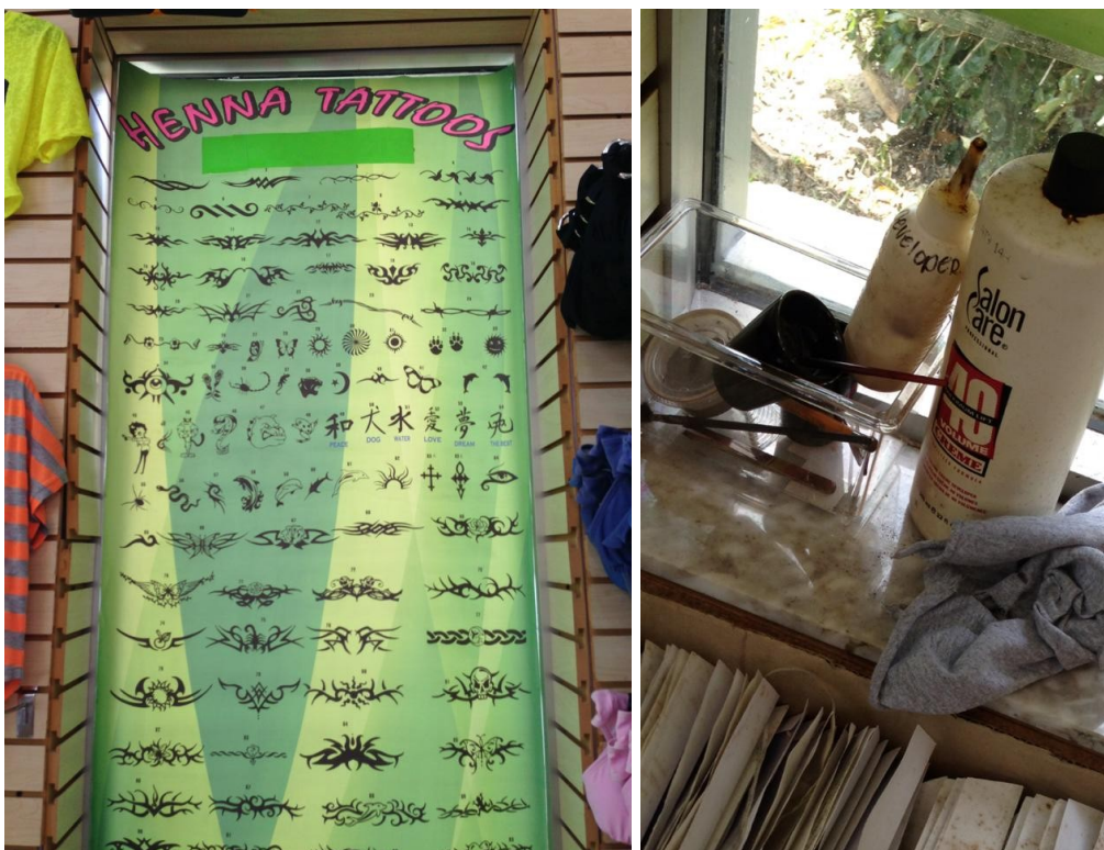
‘Black henna’ temporary tattoos for sale in Daytona Beach 14

Children beg their parents for ‘black henna’ temporary tattoos as vacation souvenirs, as permanent tattooing is forbidden to children. Children love to show off their ‘black henna’ temporary tattoo as it represents being a powerful, rebellious, dangerous adult. The children who have gotten ‘black henna’ on vacation from 1998 to 2015 (using the average age as 10) will see their first gray hair between the years 2018 and 2045. If one hundred people get ‘black henna’ as children and thirty years later purchase oxidative hair dye to cover their gray, fifty of them will have an allergic reaction and twenty of that fifty will have a severe reaction. These twenty people who have extreme reactions to hair dye may require emergency hospitalization as the swelling of the scalp from hair dye application spreads to eyes, ears, mouth and airways. Anaphylaxis reactions to para-phenylenediamine can be fatal.