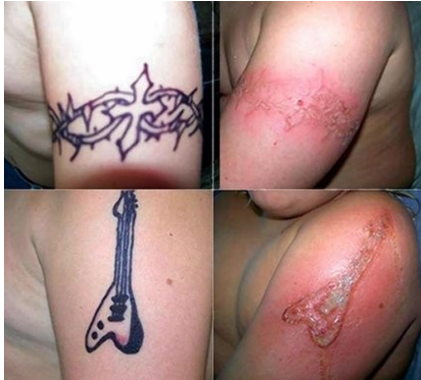
Images of 'before' and 'after' para-phenylenediamine 'black henna' on children 4

Henna is NOT black. There is no such plant as 'black henna' though there are many products labeled 'black henna.' 'Black henna' products that stain skin black in an hour contain high levels of para-phenylenediamine. The higher the level of para-phenylenediamine applied to skin and the larger the area of the temporary black tattoo, the more likely it will cause a severe allergic reaction and life-long sensitization to the chemicals in oxidative hair dye.