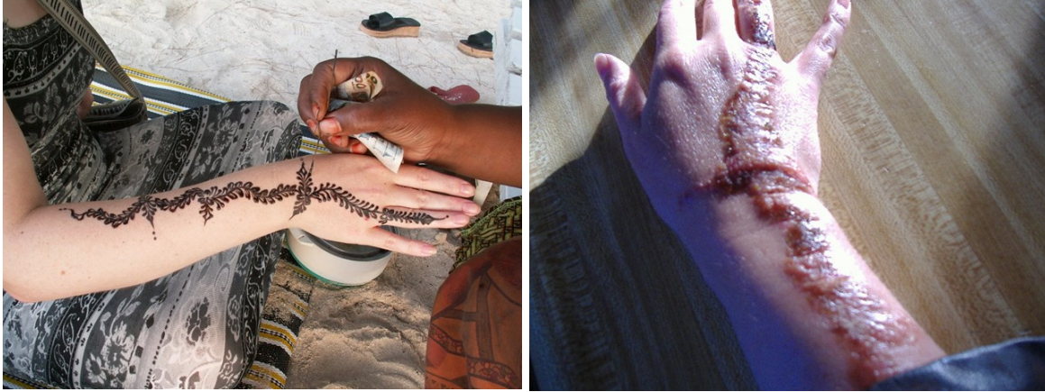
Delayed hypersensitivity reaction to para-phenylenediamine following a 'black henna' temporary tattoo 15

People who have been exposed to 'black henna' should not be assumed to be sensitized to only para-phenylenediamine; cross sensitizations to other coal tar derivative chemicals in cosmetic and consumer products are common. Toluene-2,5-diamine (PTD) is often substituted in home hair dye kits as a "PPD-free" hair dye. However, about half of people who are allergic to para-phenylenediamine are also allergic to toluene-diamines. 16