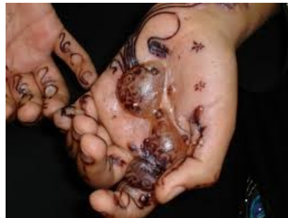
Blistering reaction to 'black henna' 17

People who have been exposed to 'black henna' should not be assumed to be sensitized to only para-phenylenediamine; cross sensitizations to other coal tar derivative chemicals in cosmetic and consumer products are common. Toluene-2,5-diamine (PTD) is often substituted in home hair dye kits as a "PPD-free" hair dye. However, about half of people who are allergic to para-phenylenediamine are also allergic to toluene-diamines. 16