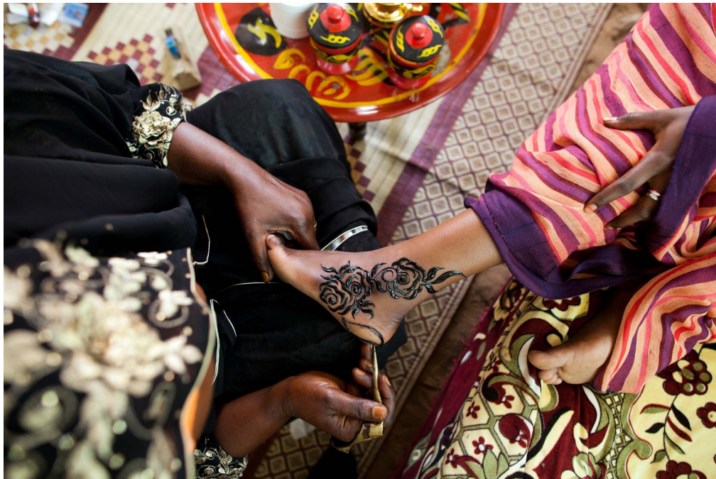
An artist applies ‘black henna’ to a woman in Darfur. 13

para-phenylenediamine. 11 All ‘black henna’ pastes that stain skin black quickly have a much higher percentage of para-phenylenediamine than was used in the assay, and most ‘black henna’ temporary tattoos cover a much larger area of skin than a sensitization patch test. Greater and prolonged exposure to an allergen creates greater risk of sensitization. ‘Black henna’ pastes contain 15% to 80% para-phenylenediamine, far more than the 10% patch test. In the few incidents that a large number of people were painted at the same time with the same ‘black henna’, 50% became sensitized to para-phenylenediamine and, by extension, oxidative hair dye. 12